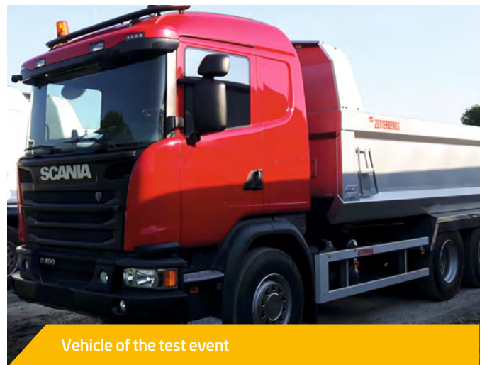
Vehicle of the test event

The torque signals can be provided to the truck control network (e.g. CANBUS) or directly to a data acquisition system (depending on the existing infrastructure and the project requirement). The torque signals can then be analysed and interpreted by OHP Services experts on a regular basis.