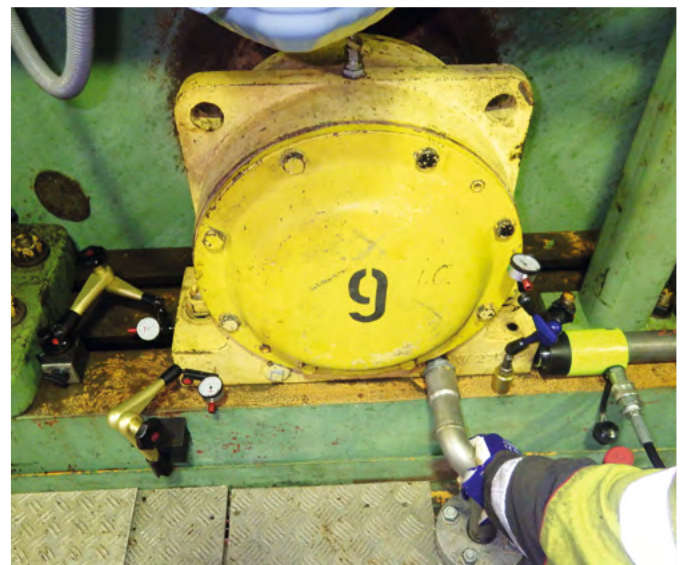
Horizontal roller alignment correction

Based on the documented data the perfect positioning of the rolls was defined and Powertrain Services; with its long experience adjusted the rolls to achieve optimised, efficient operation.